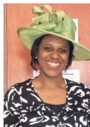
SOUTH AFRICA She was healed twenty years ago