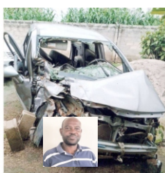
ZAMBIA He survived a terrible accident