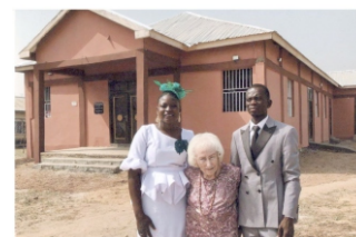
GHANA New church dedicated at Gbanyanmi