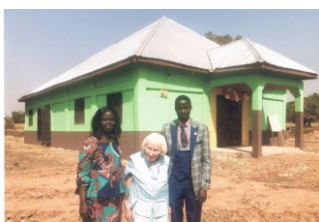
GHANA New church dedicated at Woribogu