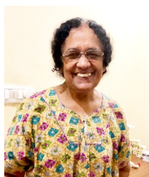
INDIA Former Hindu lady now an Evangelist